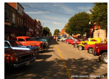
July 1 - Priceville Canada Day Celebrations