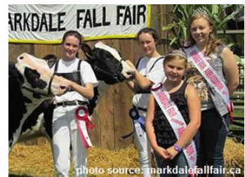
July 4- Markdale Cruise Night